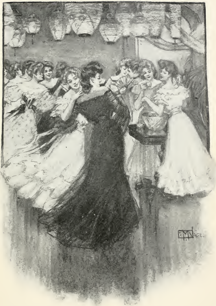
THE FLOOR WAS CROWDED