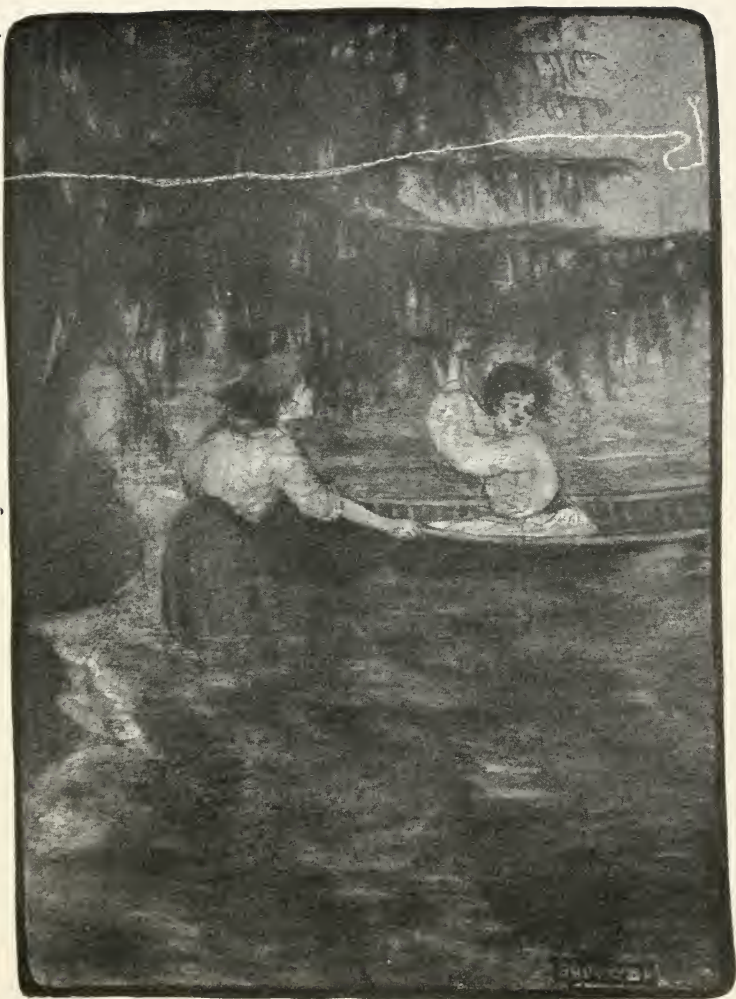
BETTY WAS NOW UP TO HER KNEES IN WATER