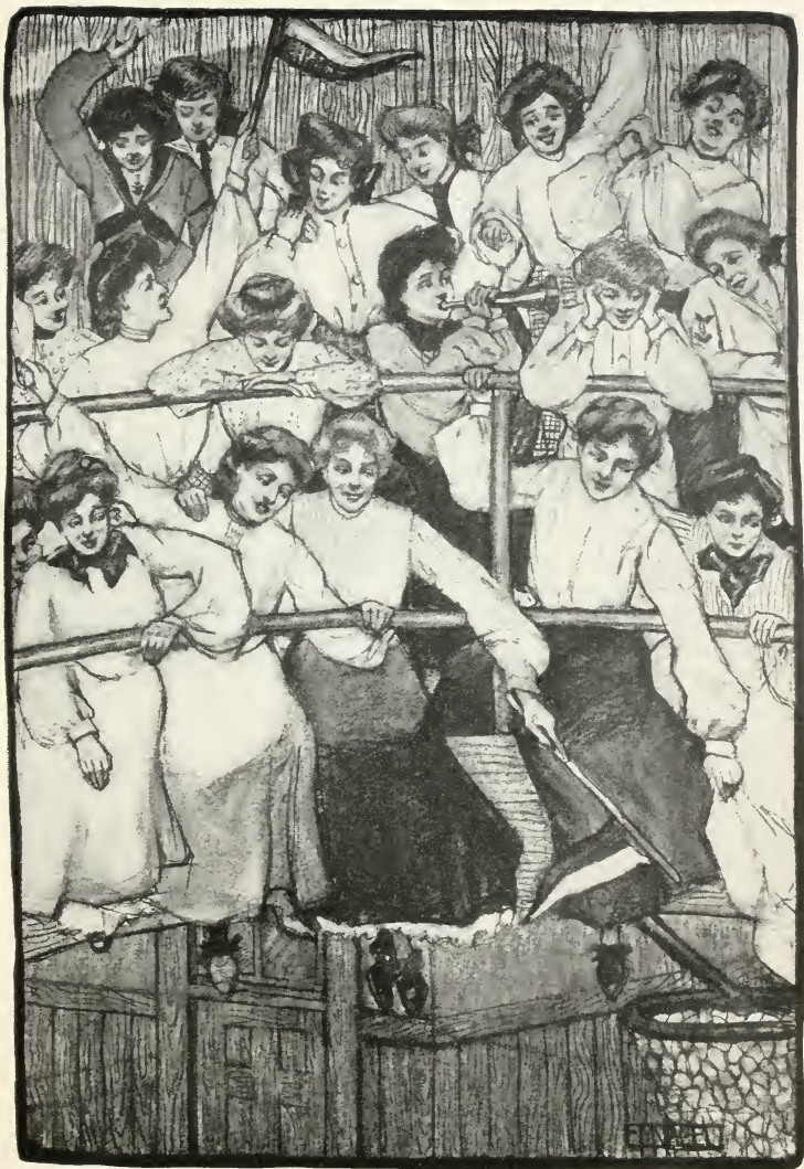
THE FRESHMEN WERE SHOUTING AND THUMPING